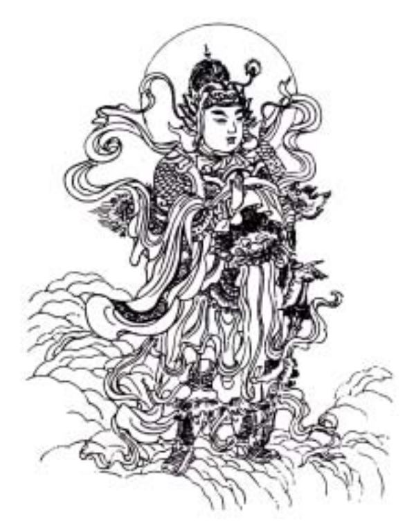
Dharma Protector Wei T'o Bodhisattva